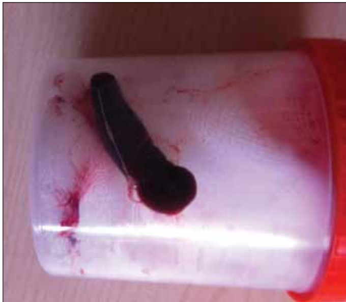
Figure 2. The leech was put in a box and measured nearly 6 cm in length

submitting with complaints of hematemesis and epistaxis (6). Bilgen et al. (7) reported a patient who complained of nasal obstruction and recurrent epistaxis for 4 months. We think that the symptoms of our patient, such as sore throat, respiratory distress, and intermittent epistaxis, were related to the leech's location, which extended from the nasopharynx to oropharynx.