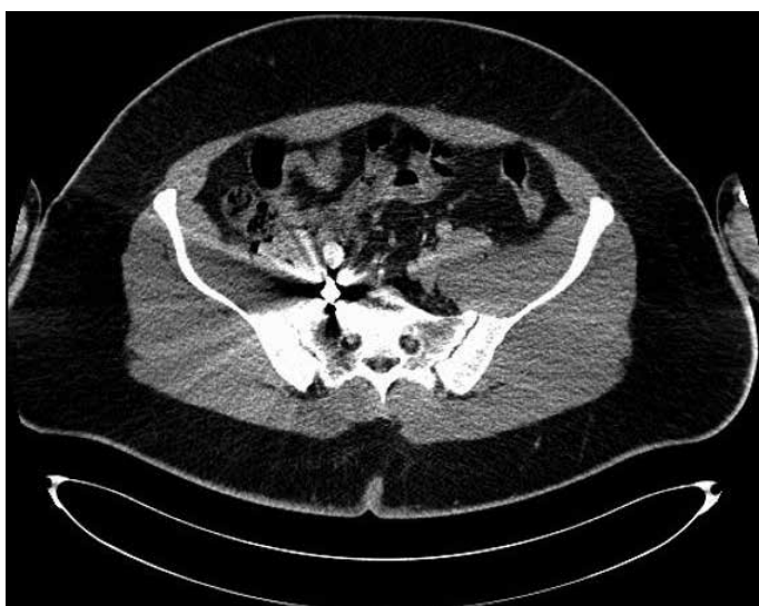
FIGURE 3. Computed tomography of the final localization of the bullet after 1 year

Non-bleeding gunshot wounds were found on the distal and medial parts of the left and right thighs, which had diameters of 1 and 2 cm, respectively. In addition, an avulsion fracture of the distal left femur was found. Radiological examinations revealed that the bullet was localized in the medial and distal parts of the right thigh (Figure 1). Right femoral venography was performed because of suspected vascular injury, and the bullet was found to be localized outside the right femoral vein. The area was washed with saline, and a broad spectrum antimicrobial solution was applied after wound debridement was completed by the orthopedist. X-ray examinations performed after 7 h revealed that the bullet in the right thigh moved to the abdomen (Figure 2). Because the localization at which the bullet was finally found was risky with respect to surgical intervention and no complication occurred during the time of observation, medical intervention was not performed to remove the bullet; periodic control was advised. The subject was discharged as no complications developed during the follow-up period and also as the bullet was observed to be localized in the same anatomical region when radiological examinations were performed after 2 and 11 months.