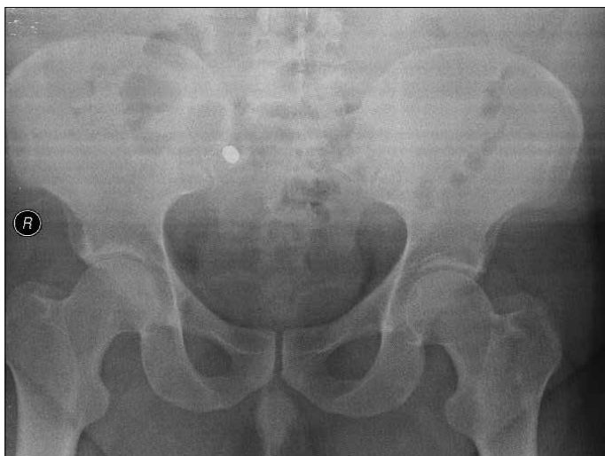
FIGURE 2. Radiographs of the localization of the bullet after 7 h